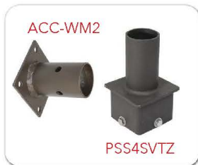
4" square pole adaptor with 2-3/8" tenon (see accessories) page