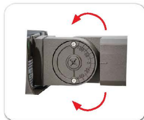
Slip fitter adjust 90° above and below center. Fits on up to 2-3/4" O.D. tenons.